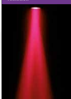
Neon activated by EUV radiation